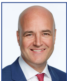
Fredrik Reinfeldt Former Prime Minister of Sweden