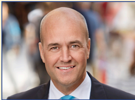
Keynote Speaker: Fredrik Reinfeldt Former Prime Minister of Sweden