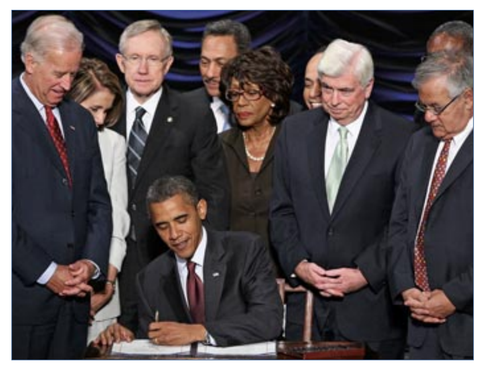
The signing of the Dodd-Frank Wall Street Reform and Consumer Protection Act on July 21, 2010 marked a historic occasion, but much of the law remains unwritten.

Beyond enforcement, the Obama administration's most enduring impact on investor protections and the integrity of the securities markets will ultimately depend on the success of the Dodd-Frank Wall Street Reform and Consumer Protection Act of 2010.