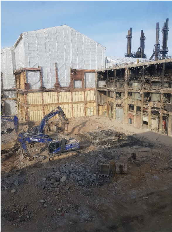
Pori Facility March 5, 2018

portion of the facility had not even been completed by that time, and infrastructure and other adjoining areas of the facility were exposed. As April 2018, demolition vehicles from Delete, a Finnish demolition company, were still in the process of tearing down the damaged Moore facility, providing direct evidence that Venator was never “on track” or “on pace” to rebuild Pori. 7