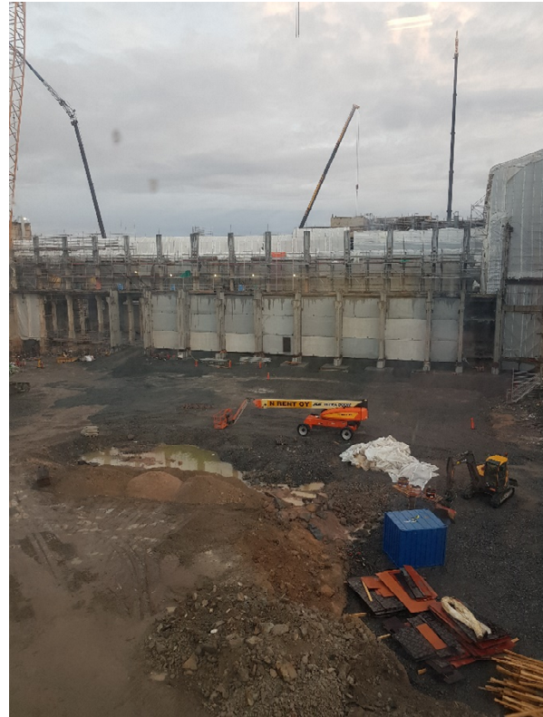
Pori Facility April 13, 2018

135. Huntsman and Venator executives knew that returning Pori to full capacity was a primary concern for investors, and that Venator had to provide concrete progress toward that goal in order to quickly and profitably separate the pigments business. To provide that assurance,